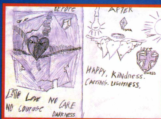
Children's drawings before and after the Journey process.